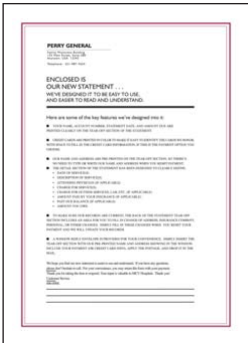
Key benefits - 8-1/2" x 11"