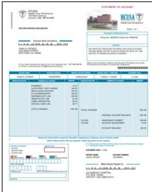
Multi-color custom statement

Emdeon Business Services is committed to providing the highest quality electronic billing services, enabling our healthcare customers to conserve valuable resources and focus their efforts on core business functions.